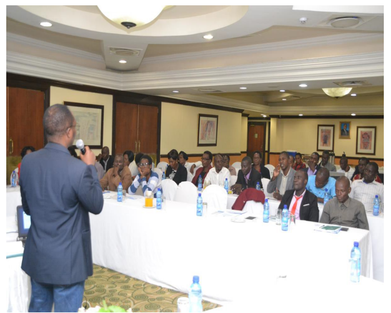
Training on ID Registration Standard Operating Procedures (SOPs)

National Registration and Identification System Project | 12 Project ID: 00100113