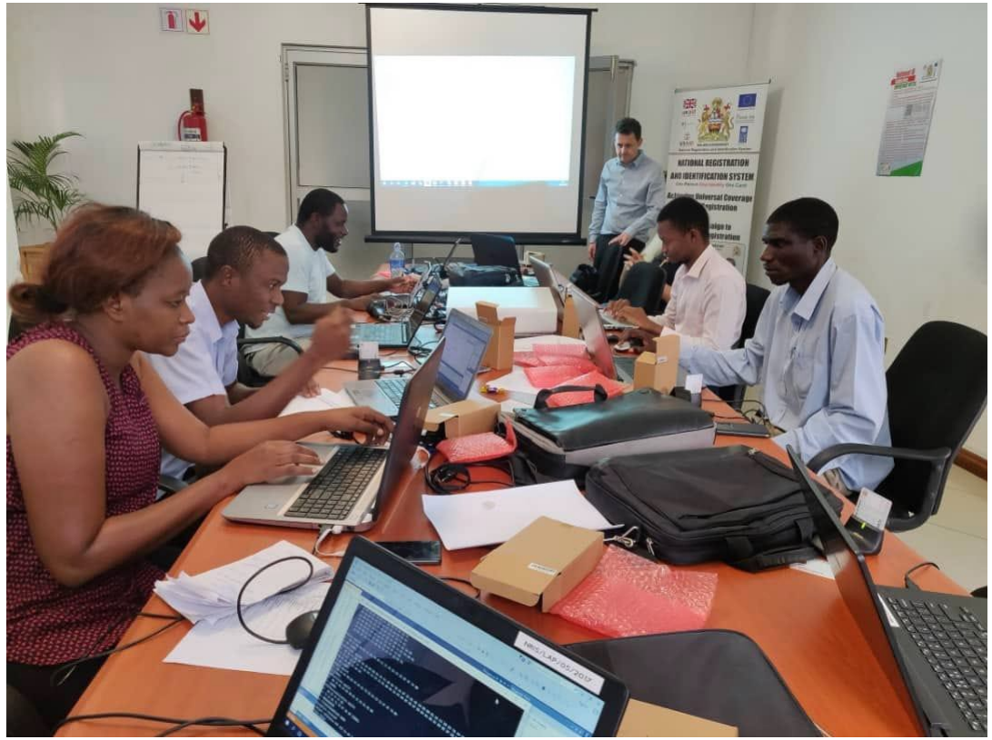
Training on Source Code Transfer in NRIS conference room