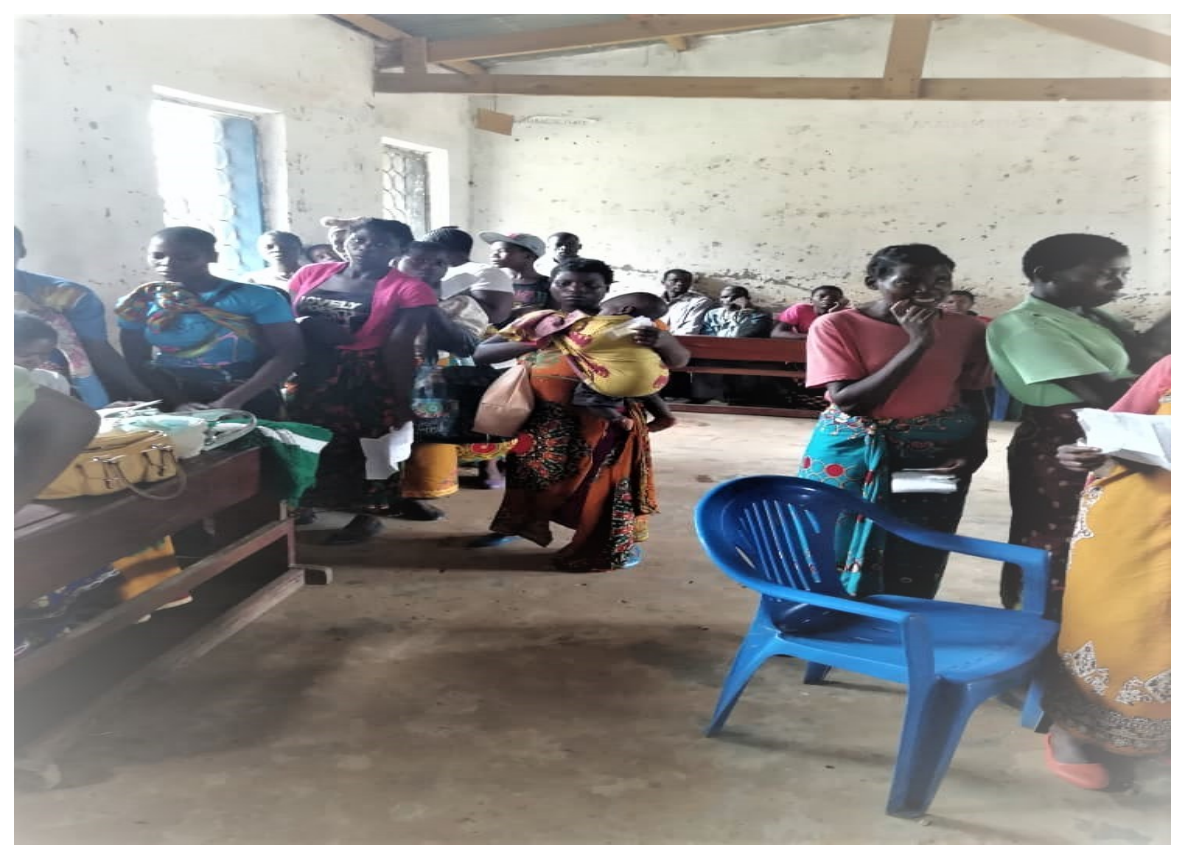
Malawian citizens collecting their national IDs

National Registration and Identification System Project 9 Project ID: 00100113